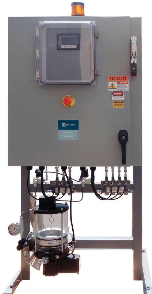
F-K Pump Auto-Lube system

The FK Pump Auto-Lube system can be started either locally from its panel, or remotely using hardwired signals.